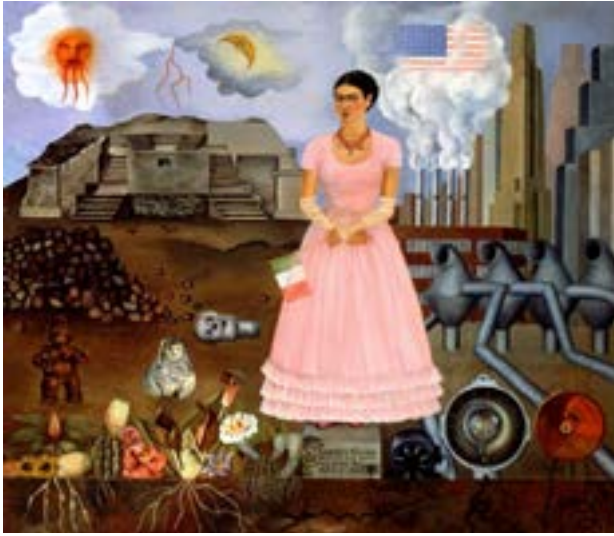
Frida Kahlo's On the Borderline between Mexico and the US, 1932