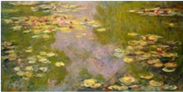
Claude Monet's Water Lilies, 1919