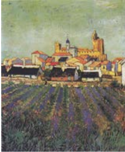
Vincent van Gogh's View of Saintes-Marie, 1888