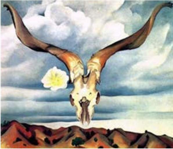
Georgia O'Keeffe's Ram's Head with Hollyhock, 1935