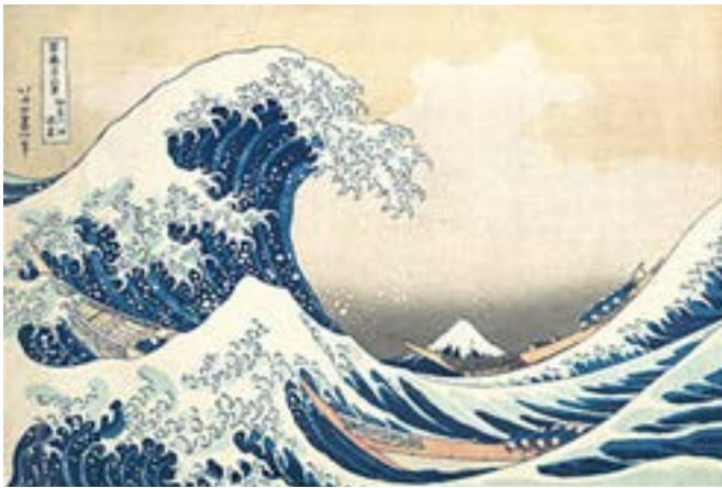
Katsushika Hokusai's Wave of Kanagawa, 1822-1829