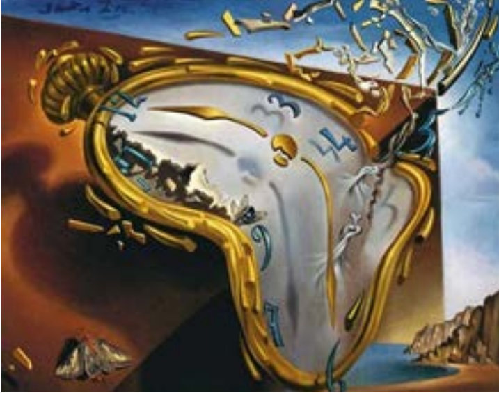
Salvador Dalí's Melting Watch, 1954